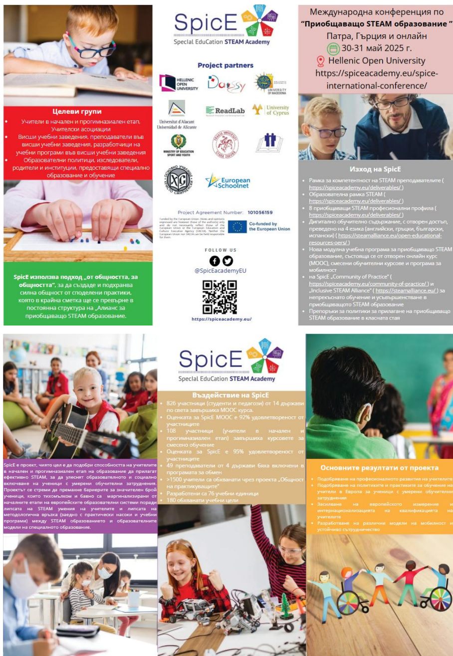
Image 6 – SpiceE final flyer in Bulgarian