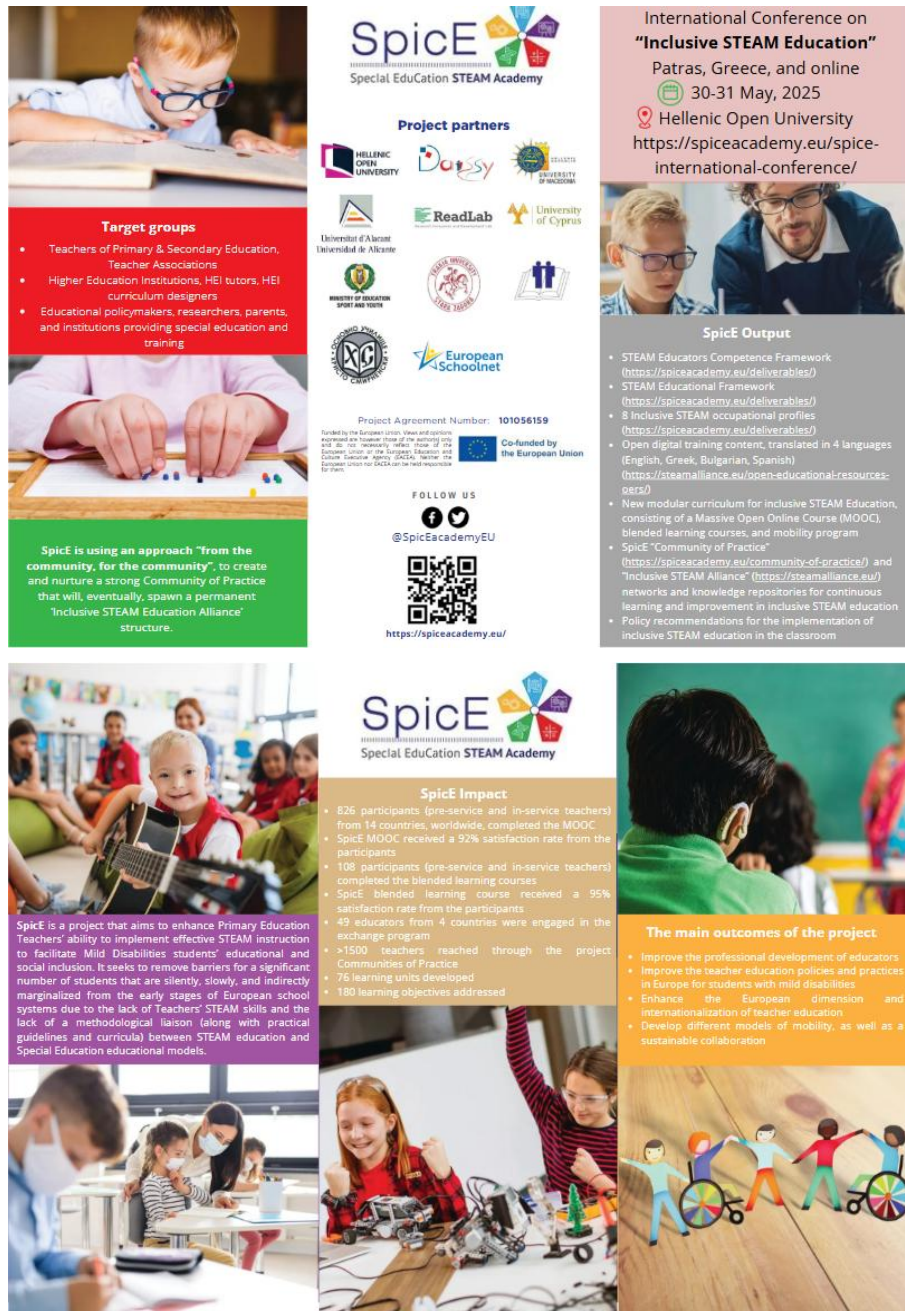
Image 5 – SpiceE final flyer in English