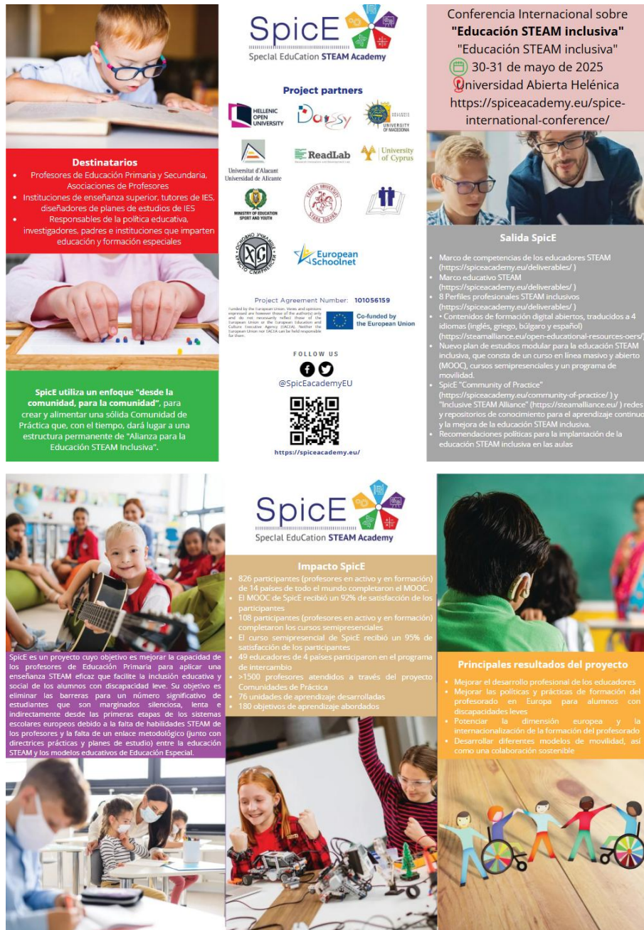
Image 7 - SpicE final flyer in Spanish