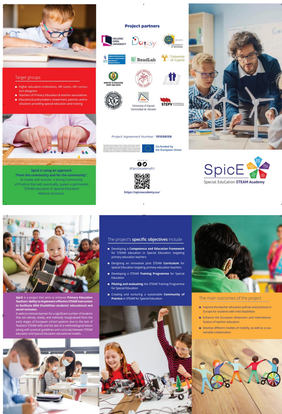
Image 1 - SpiceE initial flyer in English