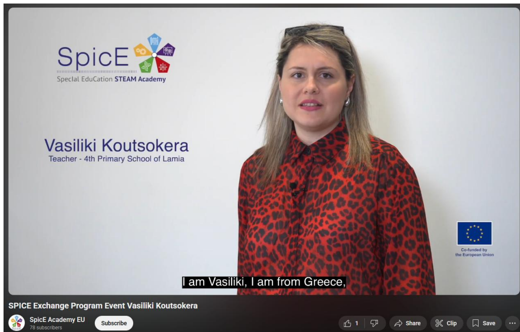
Image 10 - Screenshot from a testimonial video

These videos provided a platform for educators to reflect on their learning journey, articulate the knowledge and skills they acquired, and highlight the personal and professional value of the training. By speaking directly about the training sessions, the teachers contributed to the visibility and credibility of the project, playing an active role in its dissemination.